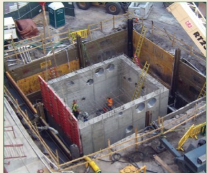
Slide Rail System