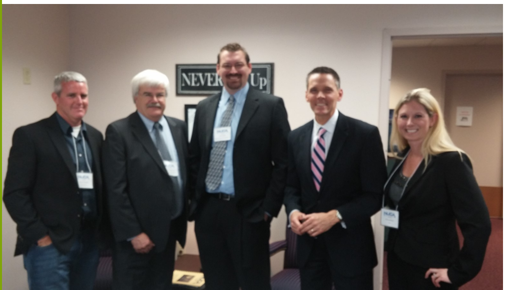
Meeting with Representative Ross Spano